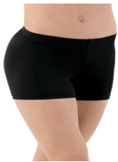
Balera - BLACK MID-LENGTH SHORTS Style # MT2764

https://www.dancewearsolutions.com/bottoms/skirts_and_tutus/s9011.aspx